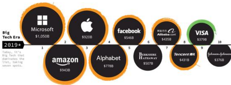
Orange: digital; green: finance; and white: consumer.

Ten years later, in 2019, seven of the 10 largest companies in the world are digital companies.